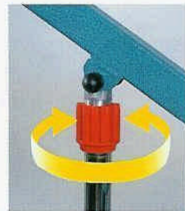
Mechanical emergency lowering system