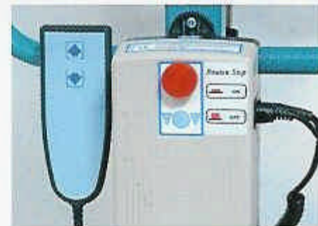
Emergency stop button